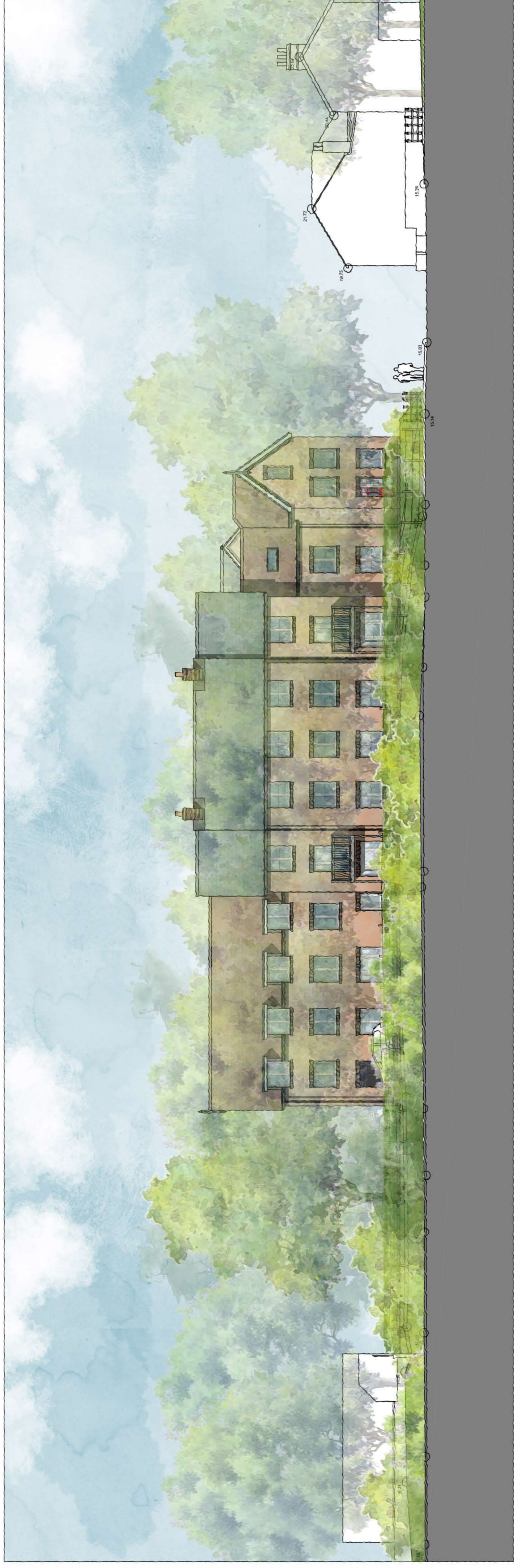
Bypass Road A27 Contextual Elevation