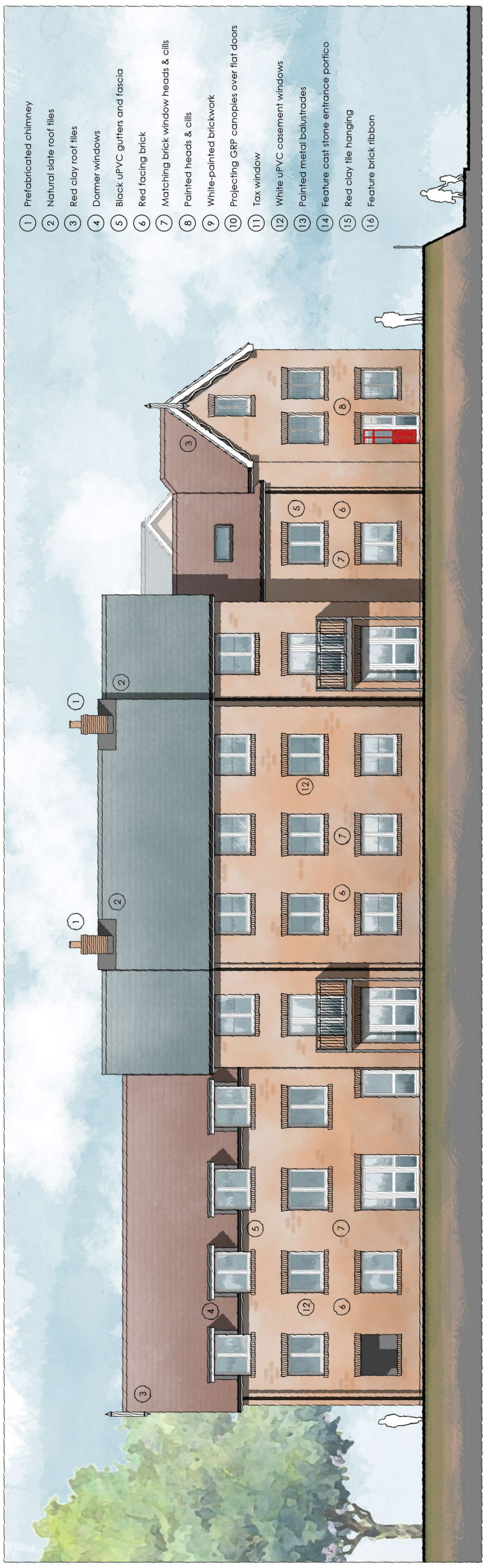
bypass road A27 elevation